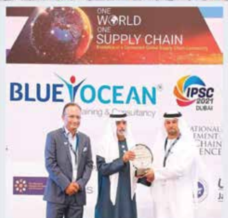
Shaikha Nahayan Bin Mubarak Al Nahayan, Minister of Tolerance and Coexistence, recently inaugurated the 6th International Procurement and Supply Chain Conference 2021, a Blue Ocean Initiative, in Dubai, which is the biggest of its kind in the Middle East.