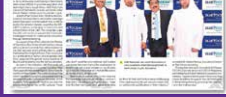
Academy supports Emiratis with free training