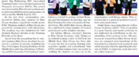
IATA reveals Middle East's top performing aviation training centre for 2020