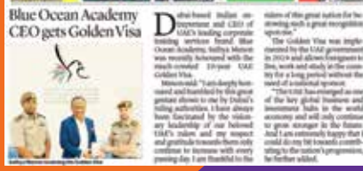
Blue Ocean Academy CEO gets Golden Visa