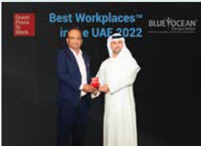
Blue Ocean Corporation, with interests in professional training, events, consulting, and recruitment across the Middle East, has been honoured with the 'Best Workplaces in the UAE 2022' title at Palm Jumeirah Hotel.